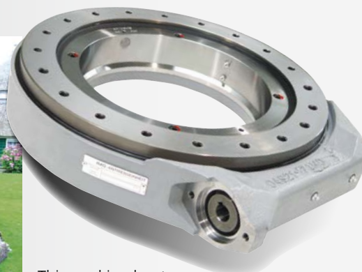
This working boat uses a WD-L slew drive for the excavator arm