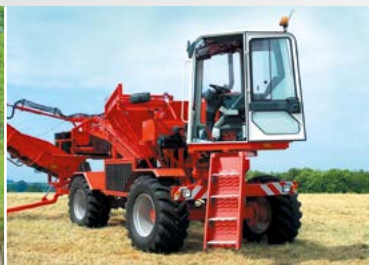
Rotating driver cab