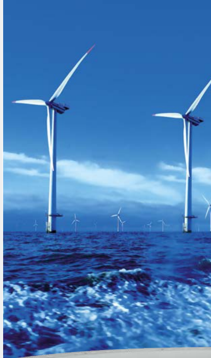
3 MW-class blade bearing, ► hydraulic pitch