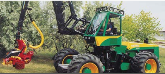
IMO slewing rings and slew drives in action:

Available in a wide range of standard sizes or as customized special solutions; optimized for the agricultural and forestry sector.