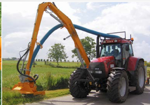
An IMO WD-L series slew drive at work:

To be able to adjust the mowing head (right) flexibly and to keep the motor block sitting vertically on sloping terrain (left).